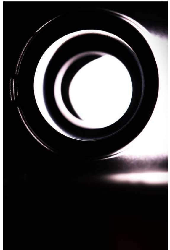
Shooting at the Olympics by Herman Lee

In the midst of creating this series, I have used the early 20 th century's art movement of Dadaism to great effect. First, I have meticulously examined and perused the subject, and contemplated the graceful elements that are contained within, the exquisite details that can make it into reality.