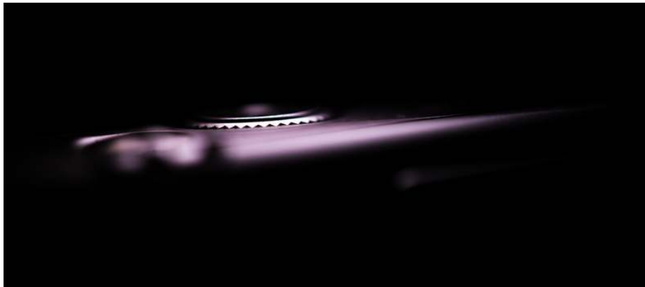
Discus throw at the Olympics by Herman Lee

A camera's primary function is to be used to capture and create visual art. If we carefully and thoughtfully consider and observe the camera, anyone can appreciate the shape and features of it to be eye catching and unique. Many cameras, regardless of texture, shape, colour, or contour can be considered beautiful and inspirational to the artistic mind.