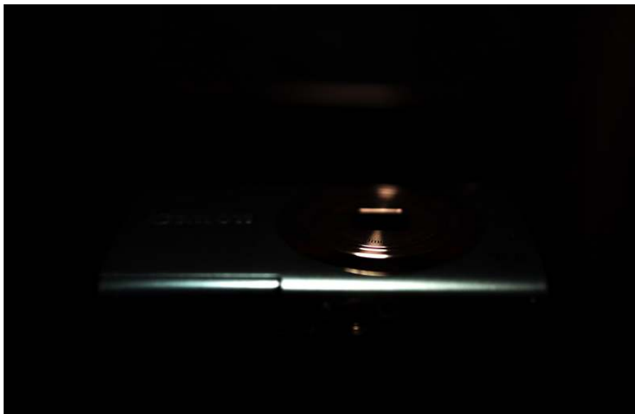
Figure skating at the Olympics by Herman Lee

On top of it all, I have also incorporated Surrealism in the way I viewed and captured the subject. I looked deeper into the hidden elements, which I discovered to surpass a camera's exterior appearance. Therefore, the camera's original function as a tool to capture images is no longer a factor. I have remodelled and recast the camera into a new revelation, a fresh and novel way which calls light to the strength and skill of an Olympic athlete.